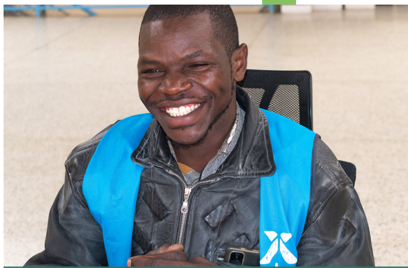
Ecobodaa is leading the shift towards sustainable transportation in Kenya with its locally assembled electric motorcycles.

With the support of FSD Africa Investments (FSDAi) investee Persistent Energy Capital, Kenyan startup EcoBodaa is preparing to enter the billion-shilling boda boda (motorcycle) and delivery bike industry with made-for-Africa electric motorcycles.